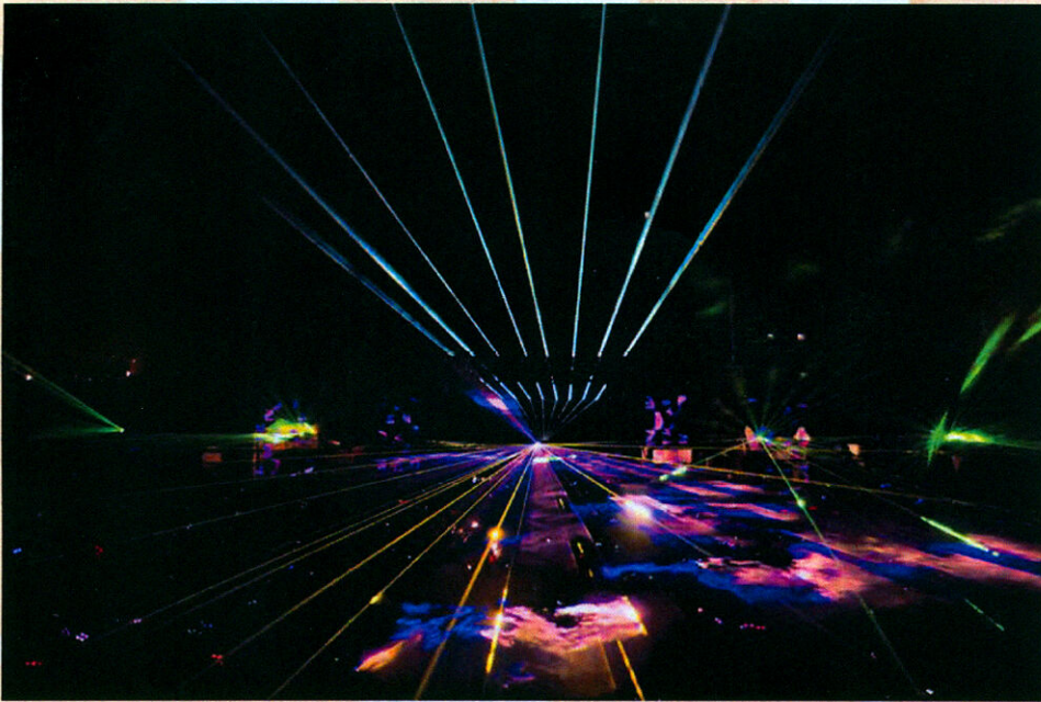
The front projection system created bouncing mirror effects during the show.

Approximately 100 metres above the stage, a Sparks system projected the New Year Countdown onto the façade of the 275-wide Palace and created mirror effects during the subsequent show, while five additional projectors were installed to create atmospheric beam effects right in front of the spectators.