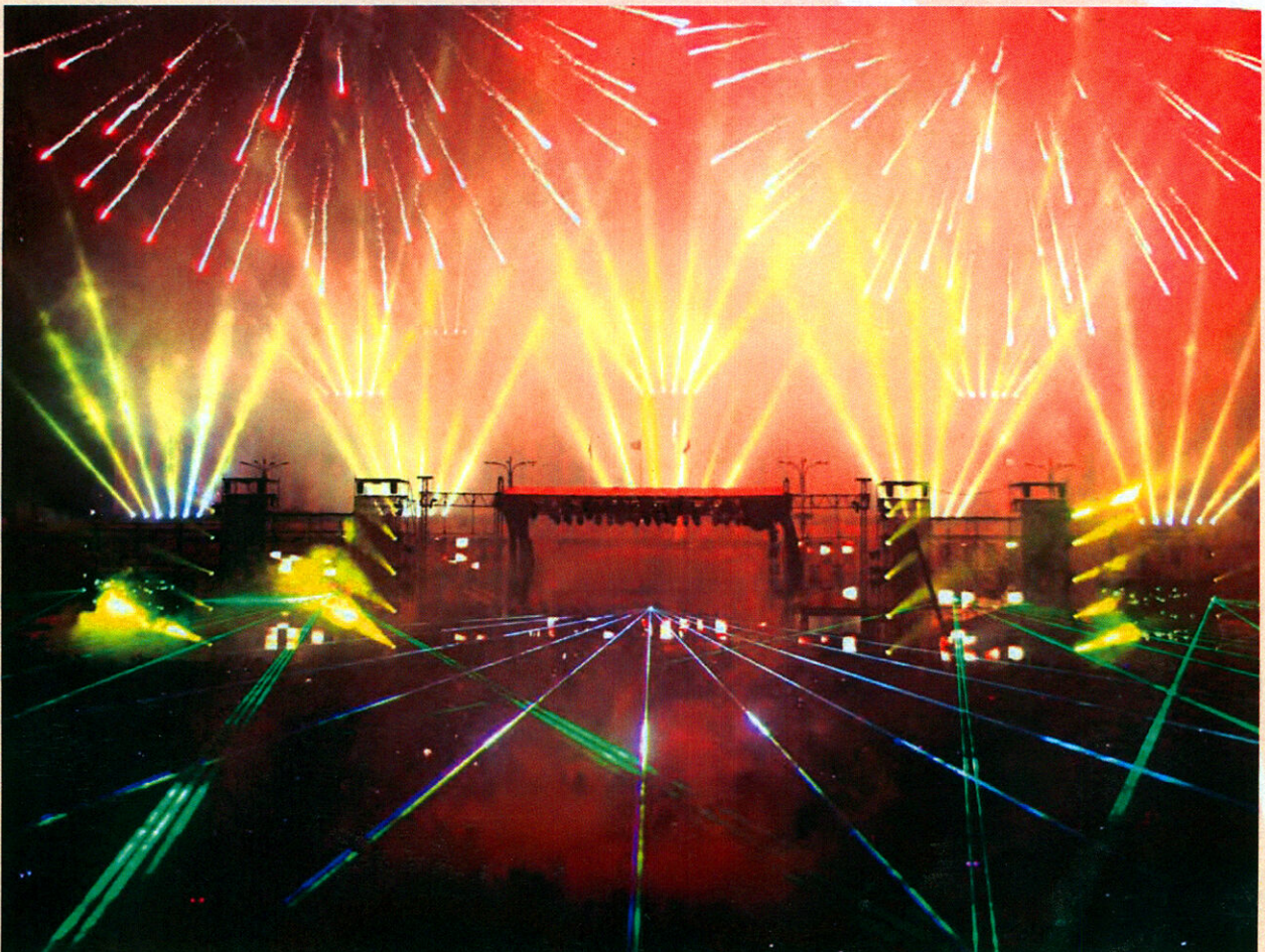
In spite of the fireworks and more than 60 Space Cannons, the laser effects were very well visible.

Thanks to the low divergence and an output power of 17 Watts per Sparks system, the laser effects were very outstanding in spite of the extremely bright background that was lit up by fireworks and more than 60 Space Cannons.