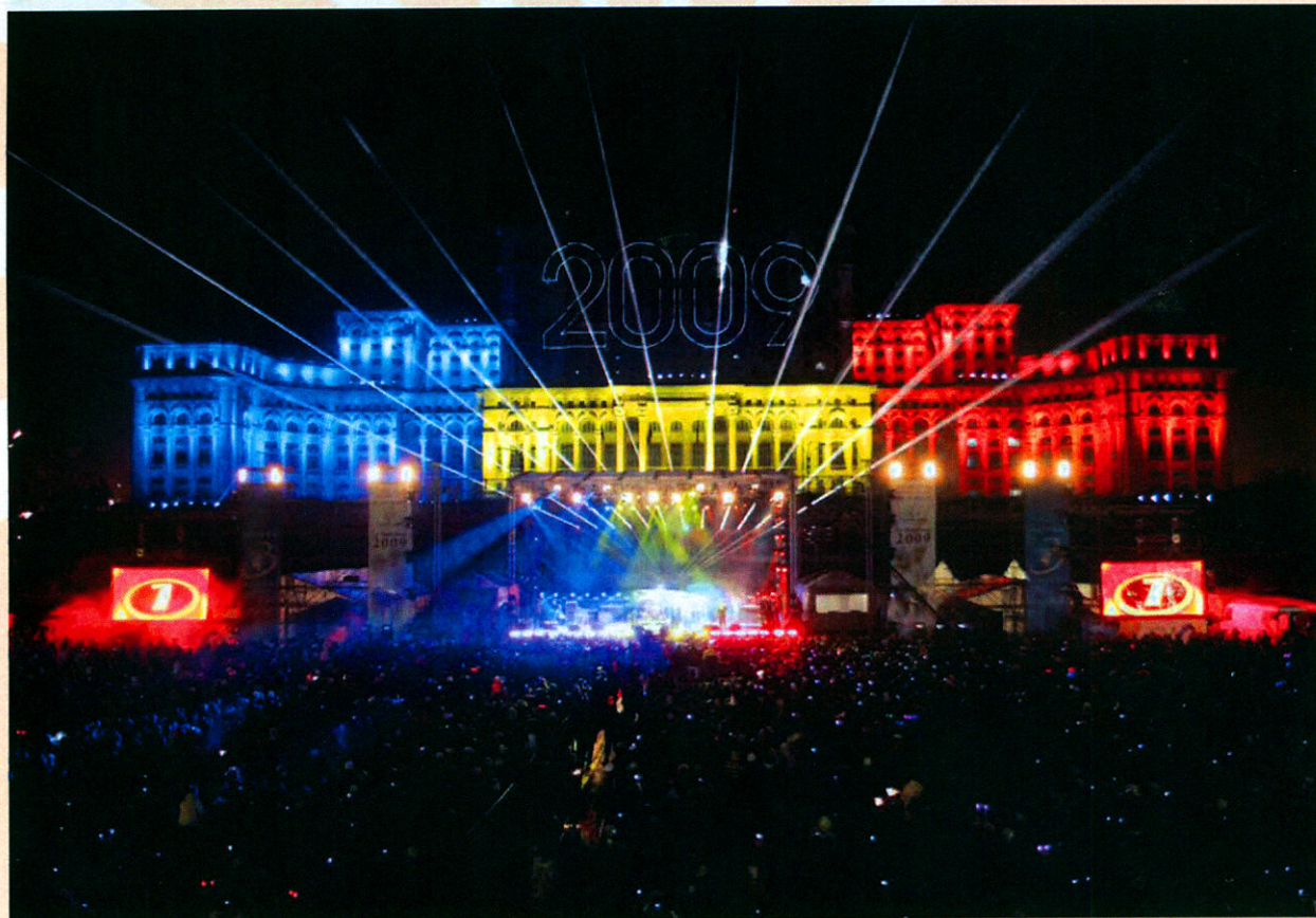
A Sparks laser system projected a countdown onto the façade of the Palace of the Parliament.

LOBO's new Sparks laser technology was probably the most spectacular medium used so far, for the 30-minute New Year Show that took place in front of the Palace of the Parliament in Bucharest, Romania.