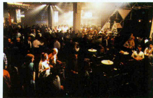
LOBO's mind blowing shows