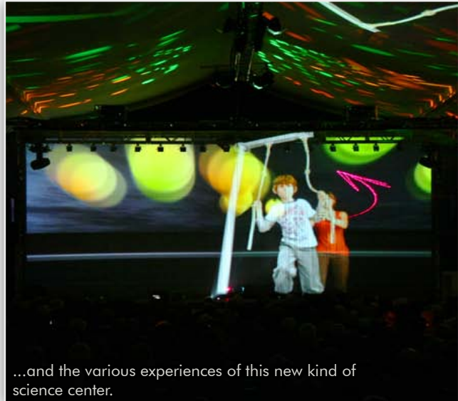
...and the various experiences of this new kind of science center.

projections, as well as atmospheric beam and lighting effects to an visually opulent spectacle. Countless on-site video recordings with young actors were enriched by the LOBO design team by computer animations, 3-D laser animations and lighting effects. Prior to the actual event, the entire show was realistically simulated in the LOBO studios and led to perfection together with the client.