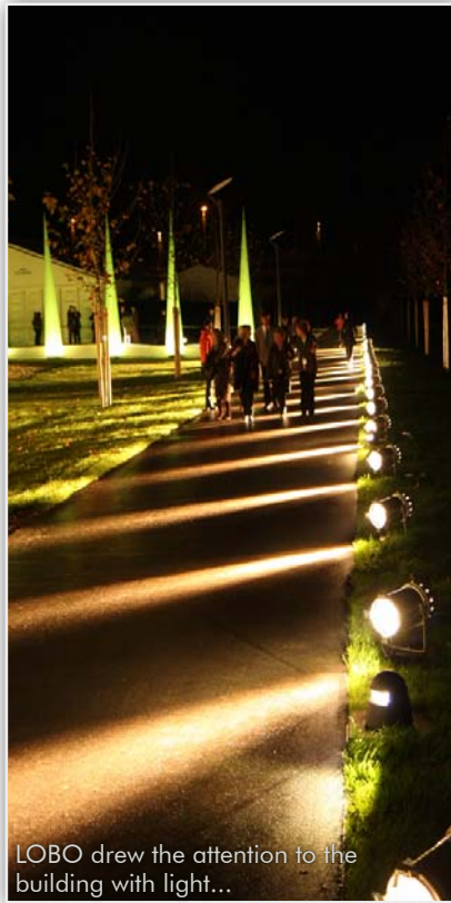
LOBO drew the attention to the building with light...

Guided by a bright laser beam, they arrived at the building to which the attention was impressively drawn by architectural luminaires and a giant outdoor laser projection.