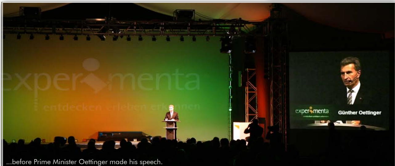
...before Prime Minister Oettinger made his speech.