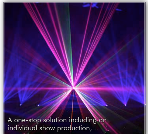
A one-stop solution including an individual show production,...

As a manufacturer with a broad product range, a system integrator for entire multimedia solutions and a multi-awarded show producer, unlike any other company, LOBO provides competent consulting giving targeted advise right from the start, technically well-founded planning services, a strong and transparent support throughout the entire production process and thus, implements even exceptional ideas quickly and cost-effectively.