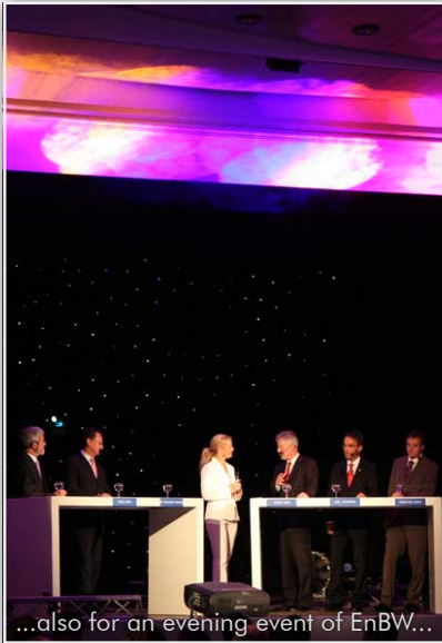
...also for an evening event of EnBW..

pendently carried out and supplied the on-site video recordings. In this specific case, this strategy was simply more cost-efficient, faster to implement and in addition, all partners could bring in their specific strengths in an optimum way."