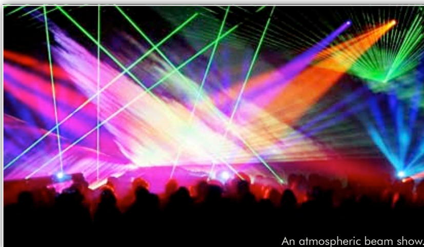
An atmospheric beam show.

Therefore, it is not surprising that the inauguration ceremony of this exceptional institution was intended to be more than just the usual niblets and fireworks.