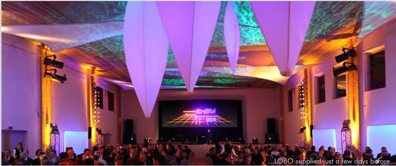
...LOBO supplied just a few days before...

This approach not only reduces costs and unnecessary stress, but also leads to superior results due a harmoniously integrated overall concept. So, sometimes equipment can be used in various ways within one project, the technical reliability is increased the omission of unnecessary interfaces and setup or dismantling times can be reduced significantly.