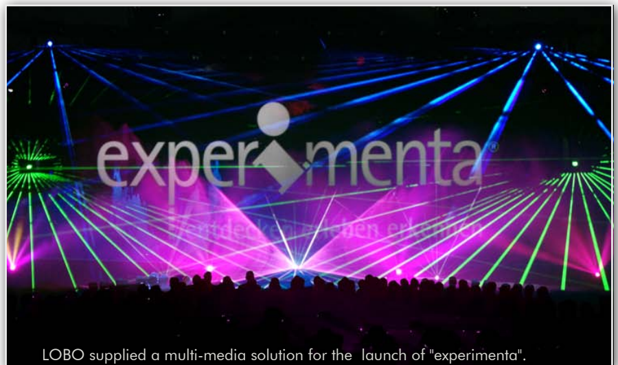
LOBO supplied a multi-media solution for the launch of "experimenta".