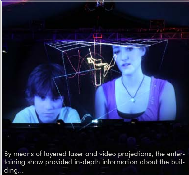
By means of layered laser and video projections, the entertaining show provided in-depth information about the building...