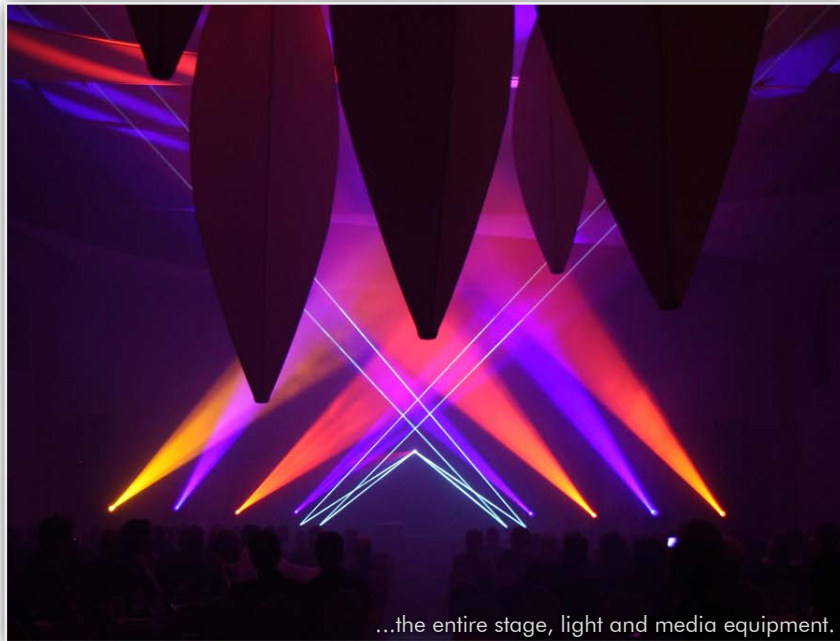
...the entire stage, light and media equipment.

Important Notice: All laser effects on the images derive from real photographs and have not been generated on computers.