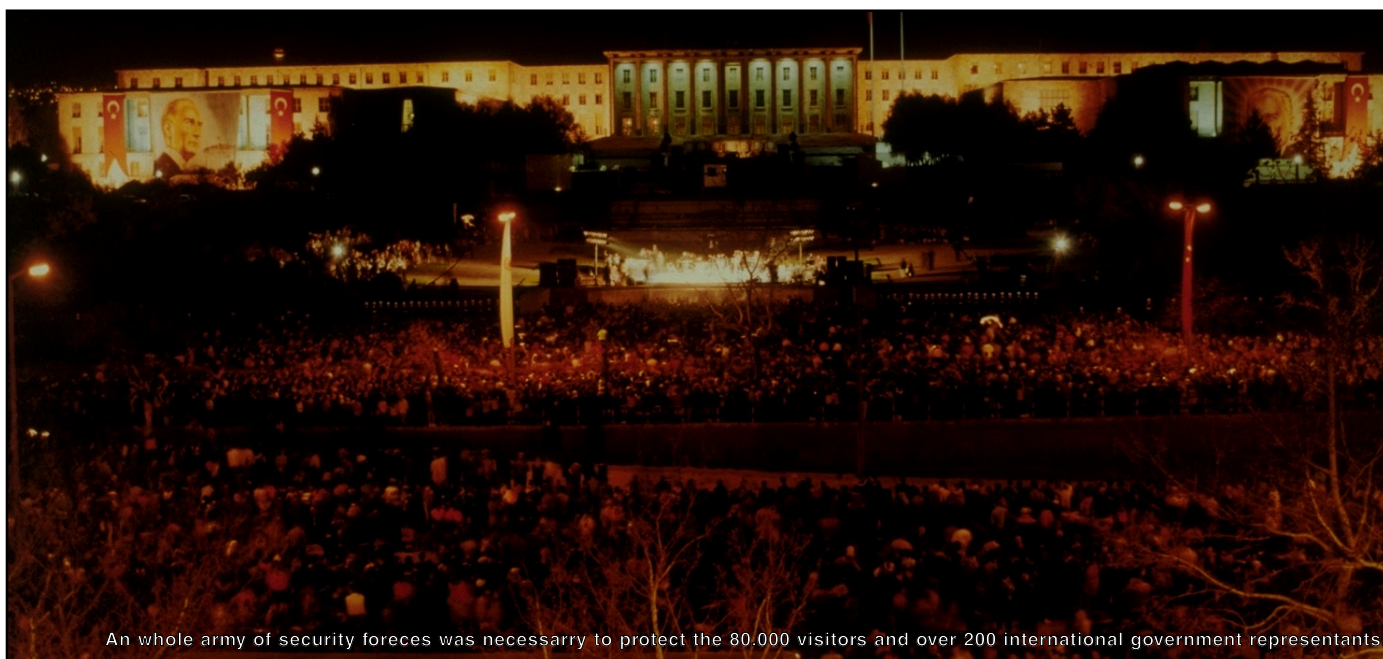
An whole army of security foreces was necessary to protect the 80.000 visitors and over 200 international government representants.

show was projected onto the water screen (approximately 15 m x 25 m) in the water basin in front of the building of the Turkish Parliament. Video projections on gauze screens (6 x 8 m) were presented on the left and right side of the basin. Additionally, there were projections with two projectors onto the building of the Turkish Parliament which is approximately 35 m high. These projectors were supplied by a fiber optics cable (150 m).