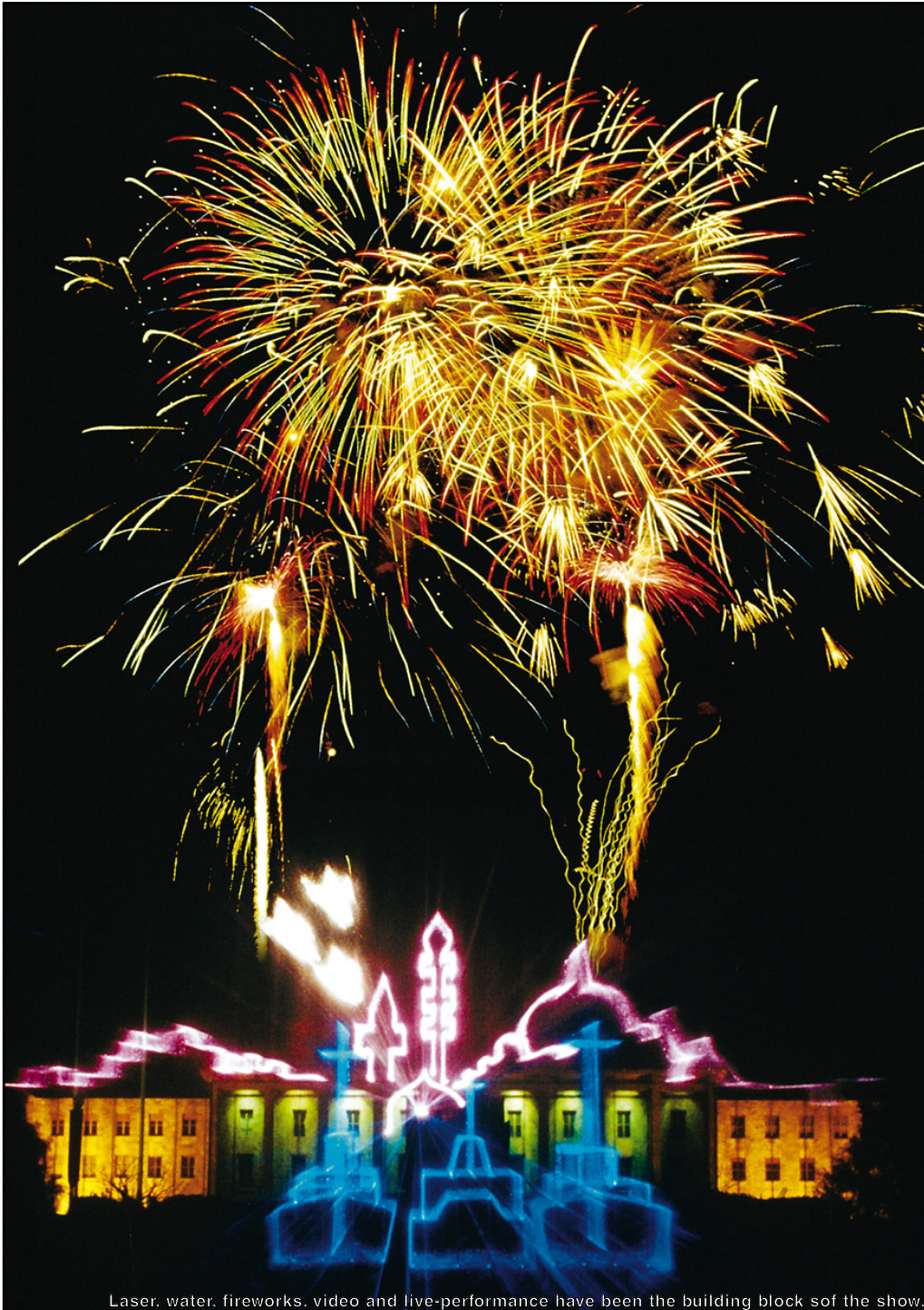
Laser, water, fireworks, video and live-performance have been the building block of the show.

LOBO has done the official celebration for the 75th birthday of Turkey in front of the houses of parliament in Ankara.