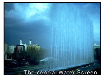
The central Water Screen.

At this High-Tech event the most modern laser technology of LOBO electronic, Germany and its Turkish trader Ajans ADS, specialist in fireworks, were used. The enthusiastic spectators could enjoy high-performance Laser systems, water screens, fireworks and a sophisticated soundtrack in Turkish. The multimedia show was partly accompanied by black-and-white authentic historical documents which were inserted by video.