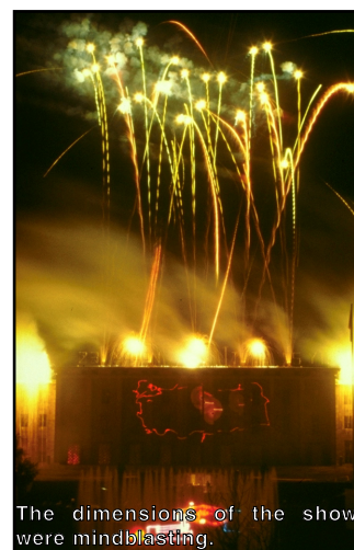
The dimensions of the show were mindblasting.

The multimedia event was a great success because of the synthesis of sophisticated laser technology, attractive show effects, authentic documents and folkloric performances.