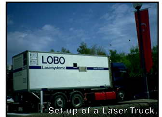
Set-up of a Laser Truck.

Directly in front of the building of the Turkish Parliament - over the roofs of Ankara - a spectacular multimedia event about the history of Turkey took place on April 23 and 24, 1995. Between 60.000 and 80.000 spectators - among them were approximately two hundred heads of state or government sitting on the VIP Lounge - were present at this great event. As crowds of people were expected a big contingent of security forces were present, too. The main streets were cordoned.