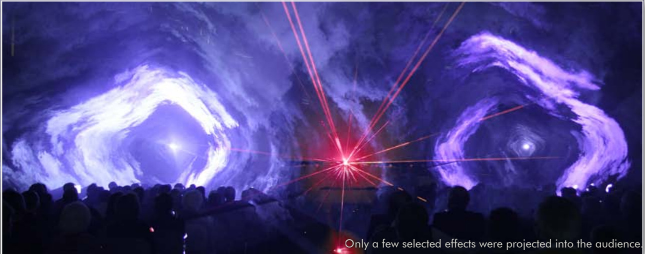
Important Notice: All laser effects on the images derive from real photographs and have not been generated on computers.

Internet: www.lobo.de, Email: mail@lobo.de