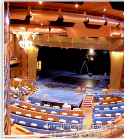
Installation in "Fortuna's" 1.000-seats theater.

standard and service lasers and lasers are not the same. When asked about their new partner LOBO, Costa's Entertainment Manager goes into rapture: