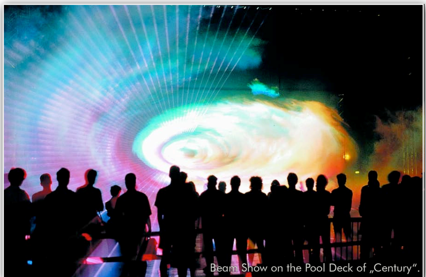
Beam Show on the Pool Deck of „Century“.

With pride LOBO now can claim not only to be the market leader in the laser show industry at land but also to be the established premium supplier of laser systems on the Seven Seas.