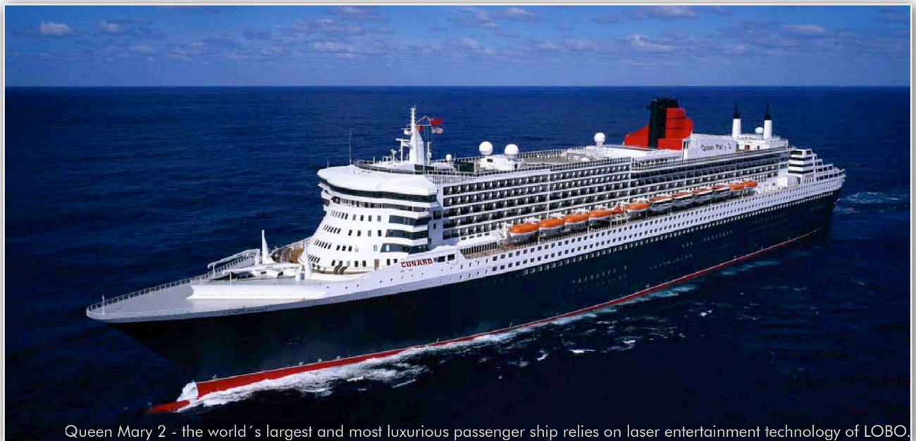
Queen Mary 2 - the world's largest and most luxurious passenger ship relies on laser entertainment technology of LOBO.

With a whole series of sensational installations on cruise ships, LOBO established itself as the premium supplier of laser systems on sea.