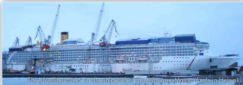
The „Mediterranea“ in the shipyard of the Kvaerner-Massa Yards in Helsinki.