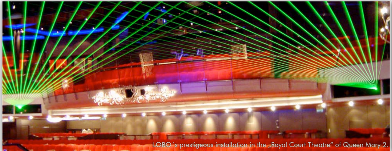
LOBO´s prestigious installation in the „Royal Court Theatre“ of Queen Mary 2.

"The laser shows are greatly appreciated by our guests. From our side I must say it is a very nice system, extremely user friendly and very easy and efficient to maintain. I'm very glad of our choice!"