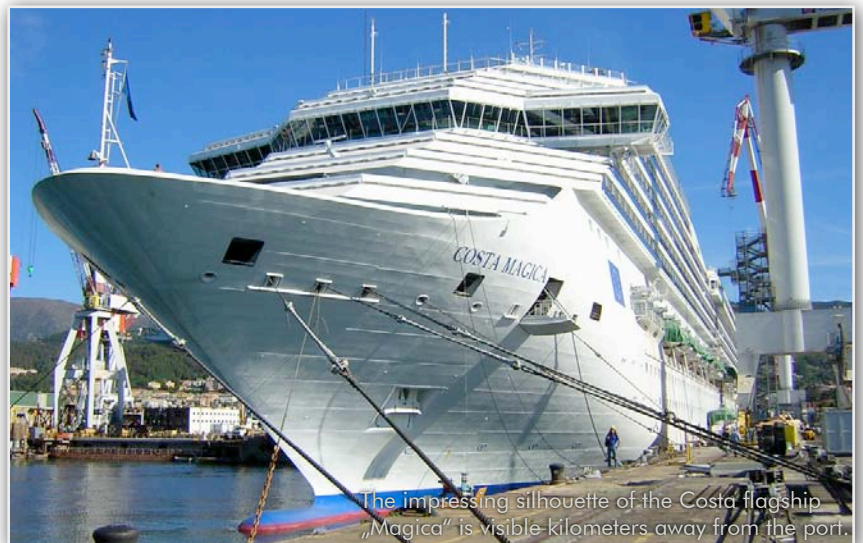
The impressive silhouette of the Costa flagship „Magica“ is visible kilometers away from the port.

theatre for more than 1.000 guests, which would even be a sensation on land regarding its equipment and size.