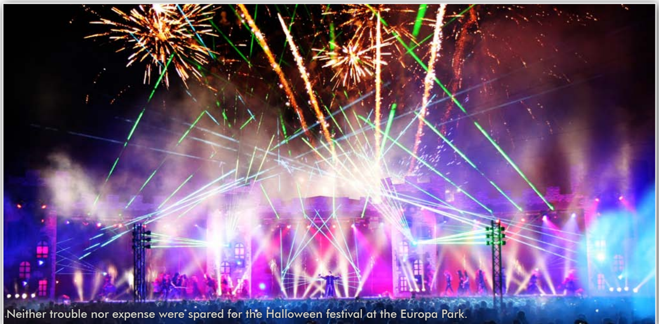
„Neither trouble nor expense were spared for the Halloween festival at the Europa Park.

For the Halloween season at the Europa Park, LOBO was engaged in the Halloween show, which has been very successful for many years and in an additional project.