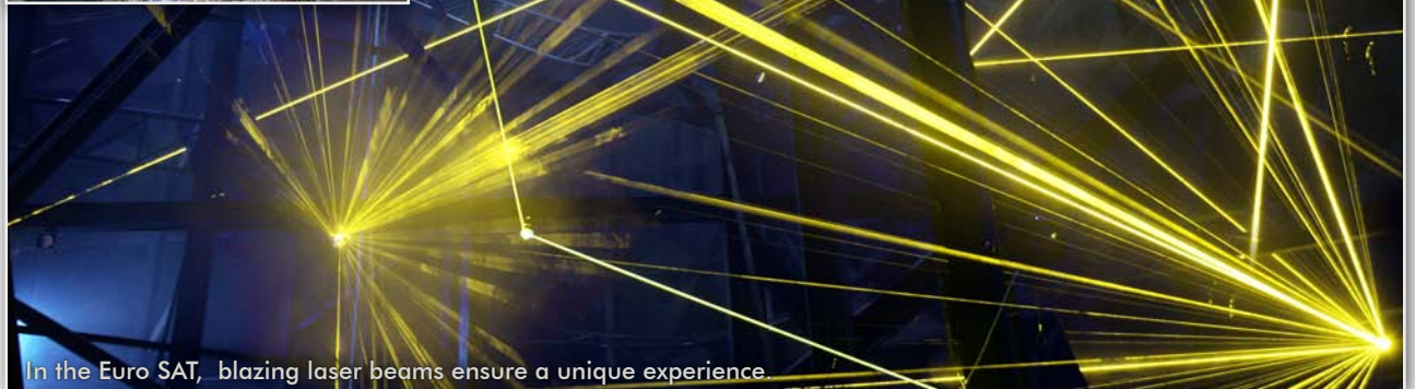
In the Euro SAT, blazing laser beams ensure a unique experience.