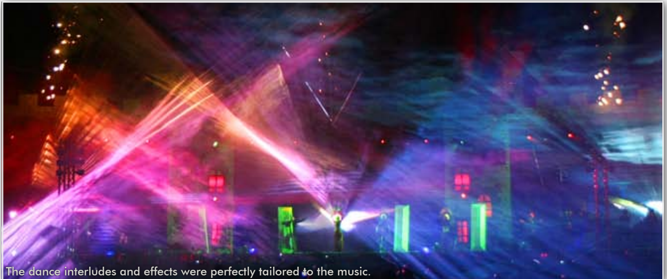
The dance interludes and effects were perfectly tailored to the music.

of laser, fountains and pyrotechnics as well as dance interludes was perfectly tailored to the music which was exclusively composed for the show.