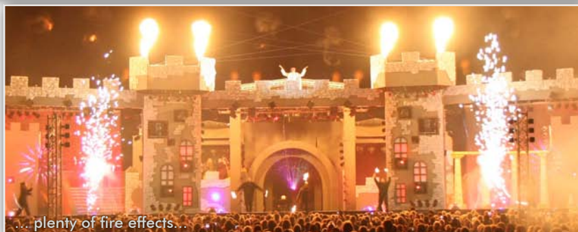
... plenty of fire effects...