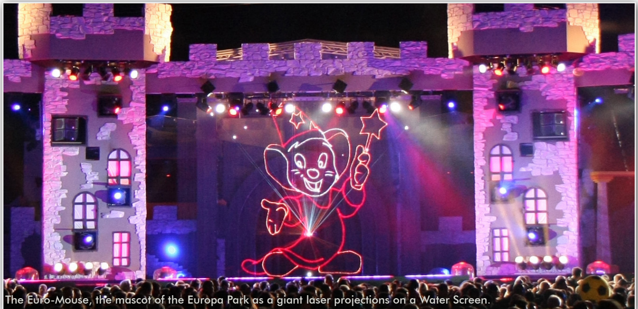
The Euro-Mouse, the mascot of the Europa Park as a giant laser projections on a Water Screen.

visitors in the Europa Park ever was reached.