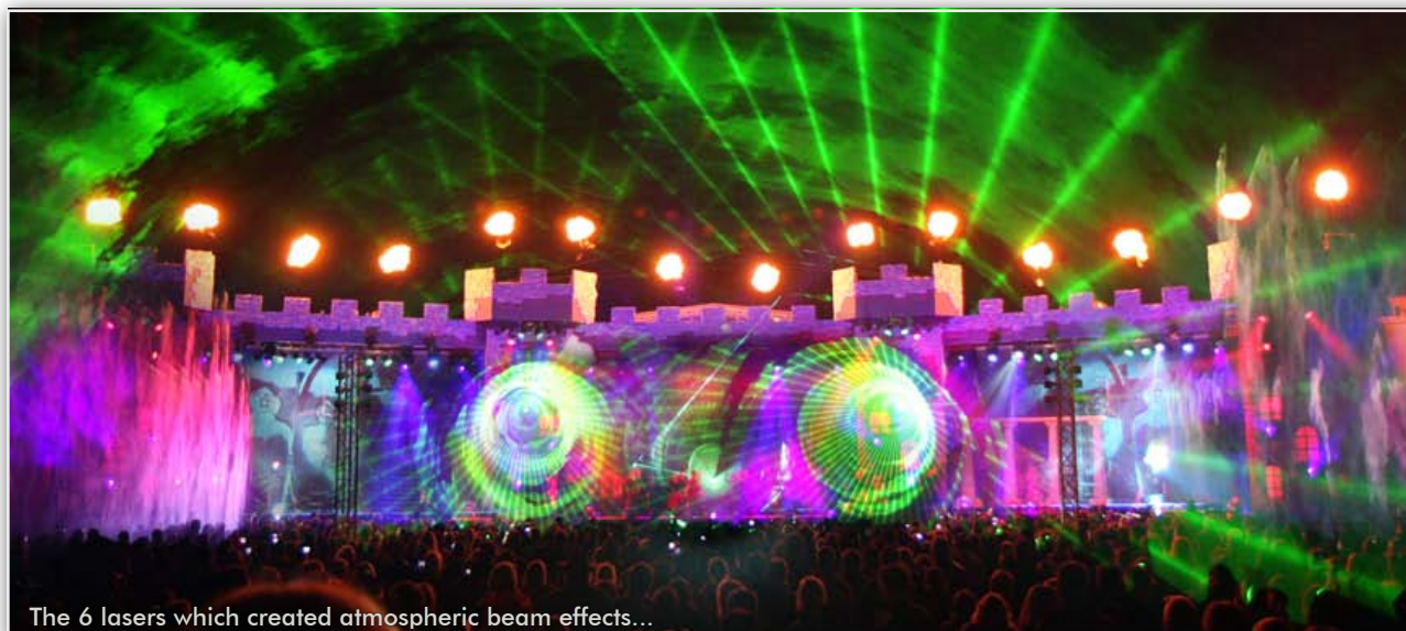
The 6 lasers which created atmospheric beam effects...