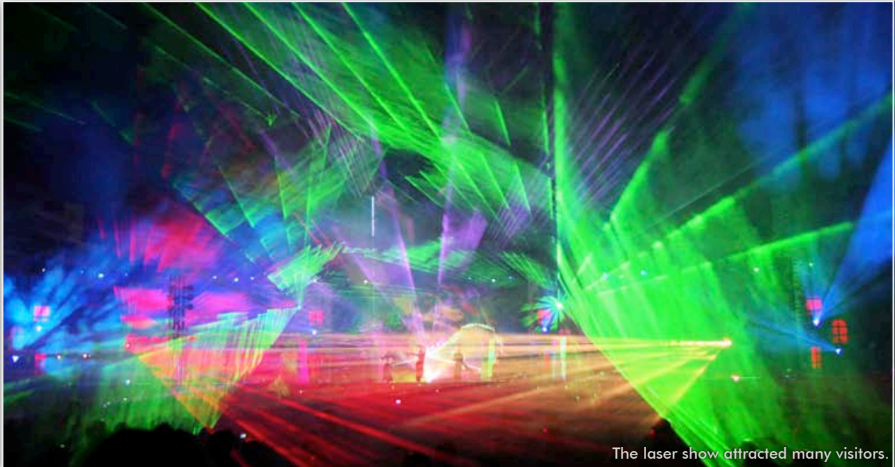
The laser show attracted many visitors.

Both projects were extremely successful: Although the installation in the roller-coaster was initially planned to be only temporary for a few weeks, the