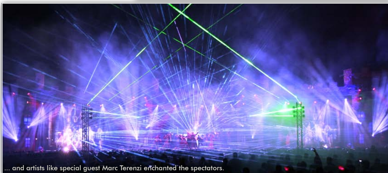
... and artists like special guest Marc Terenzi enchanted the spectators.